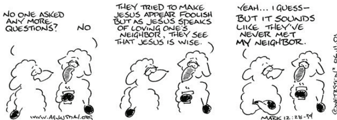
Agnus Day appears with the permission of www.agnusday.org

Excerpt: 2018 Workbook for Lectors, Gospel Readers & Proclaimers of the Word.